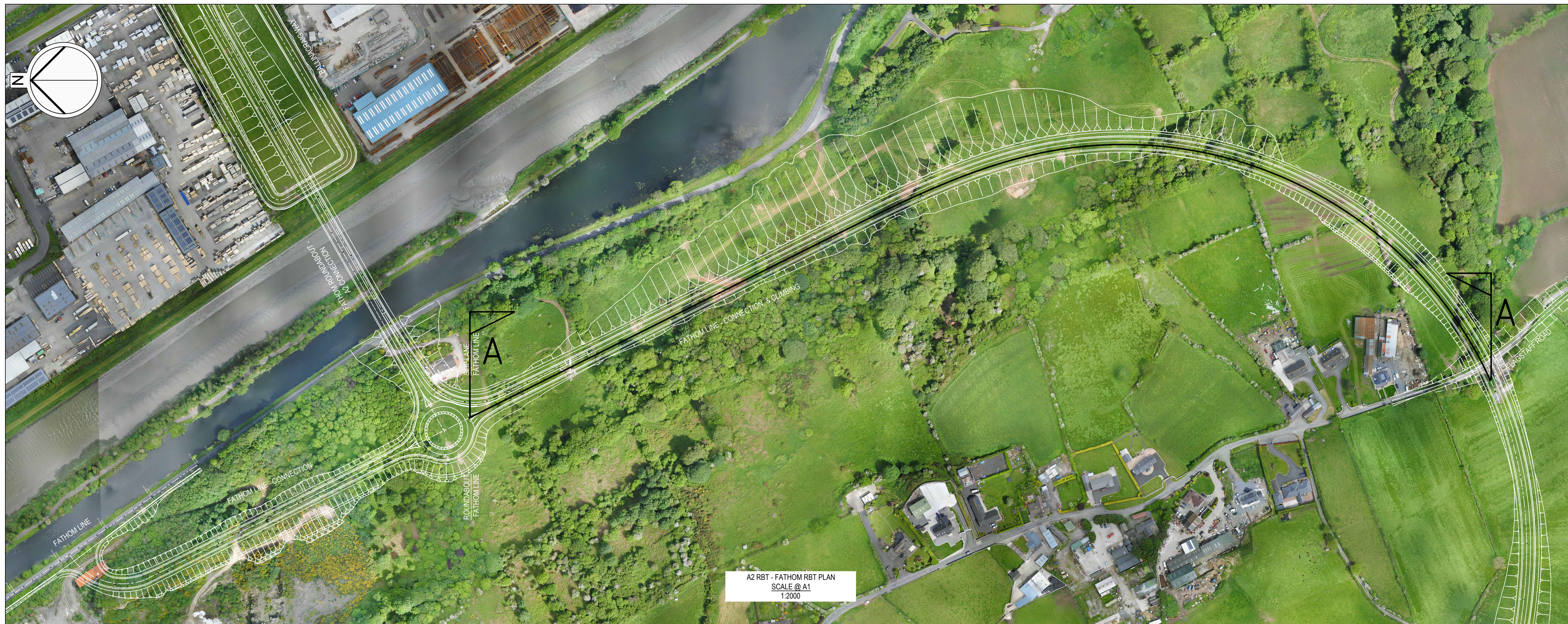
A2 RBT - FATHOM RBT PLAN SCALE @ A1 1:2000